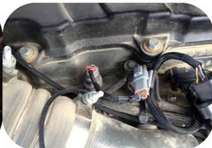
Triangle-shaped MAP Sensor

Step 4) Disconnect the MAP Sensor. Plug male connector from the module into the stock MAP Sensor on the engine. Plug stock male connector into female connector on module harness.