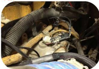
Rectangular-shaped MAP Sensor

Note: Use the injector connector on the module harness marked “Fan”