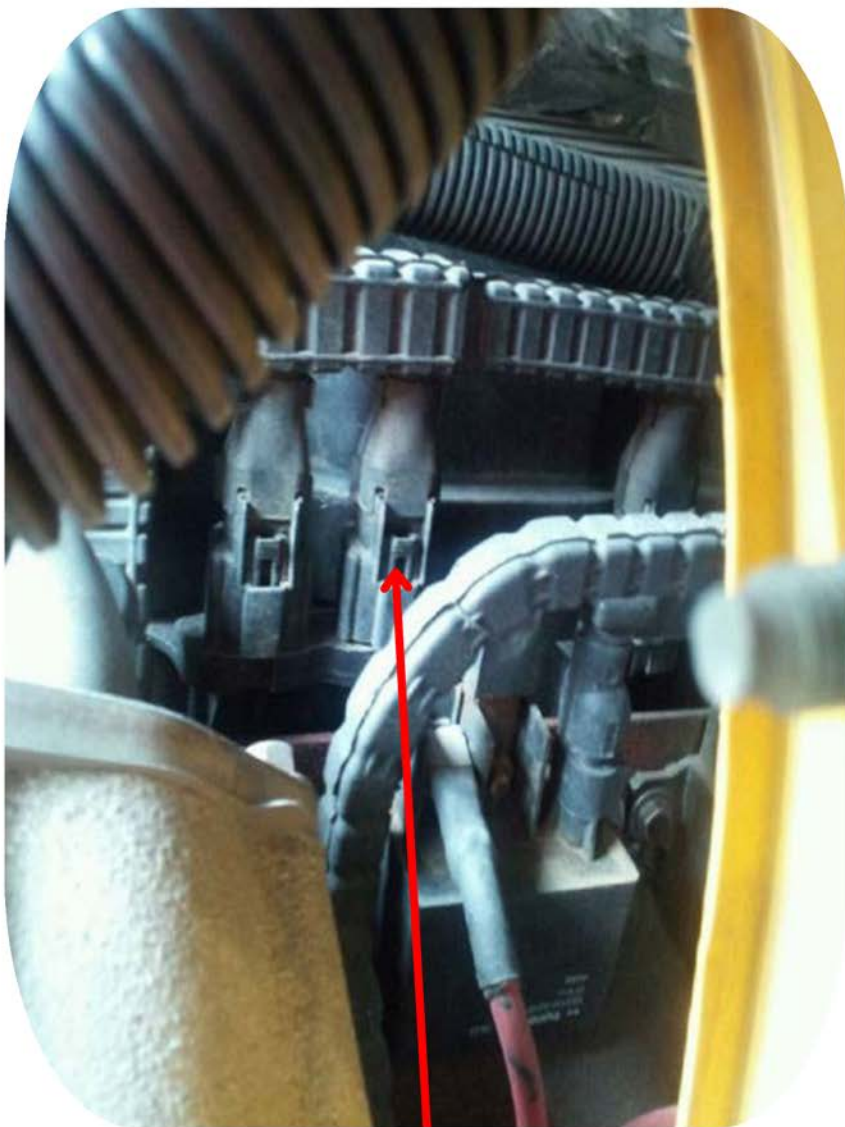
3rd Engine Connector

Step 2) Locate 3 rd engine connector from front of engine as shown in Picture.