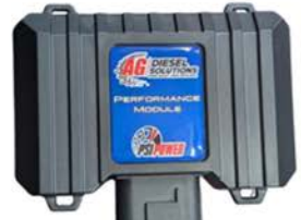
Ag Diesel Solutions Module