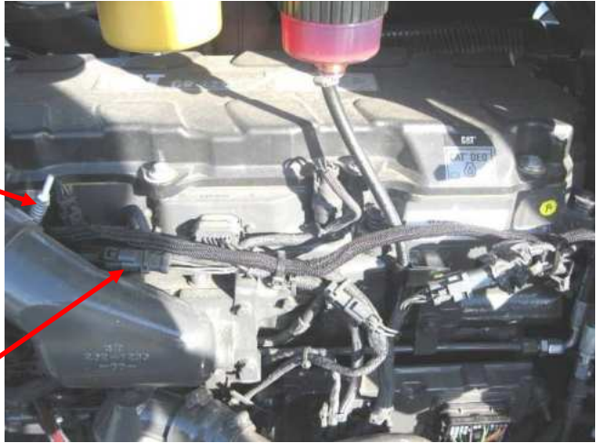
06-08 C9 CAT Engine