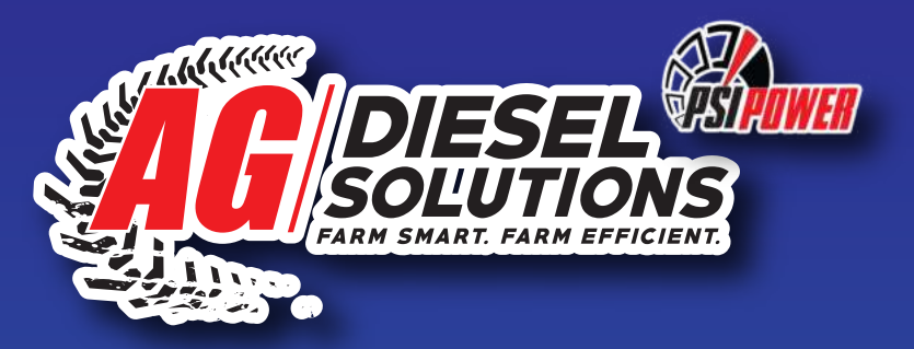
• UP TO 30% HORSEPOWER INCREASE