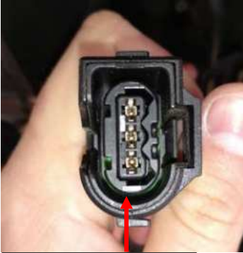
Stock Female Fuel Pressure Connector