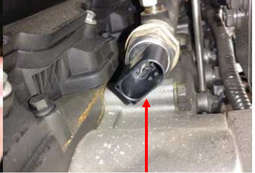
Stock Male Fuel Pressure Sensor